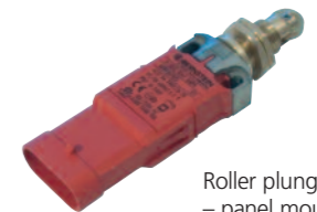
Roller plunger actuator - panel mounting