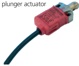
Roller plunger actuator