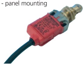
Roller plunger actuator - panel mounting