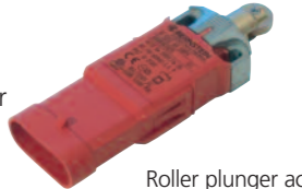
Roller plunger actuator