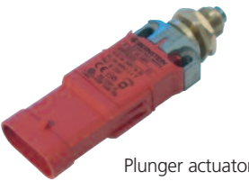
Plunger actuator - panel mounting