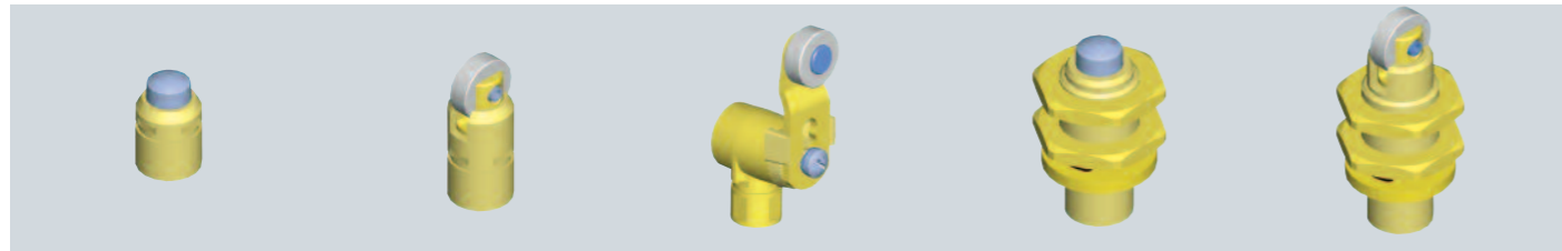
Plunger actuator ... iw