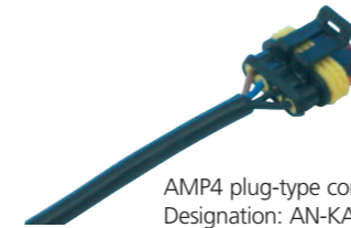
AMP4 plug-type connector. Designation: AN-KAB.IF_5M_AMP4. Article number: 325.1204.281