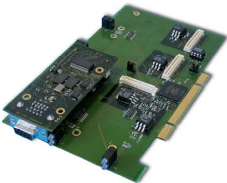
Test and evaluation board, carries up to 4 ENI modules