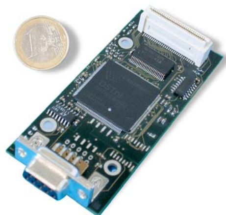
The DC100PFB ENI Profibus daughter card