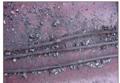
WSOR cables covered and undamaged by weld slags