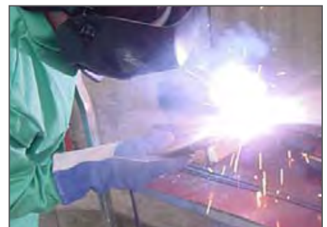
WSOR cable during S3000 welding test