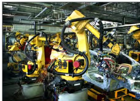
Industrial Automation Assembly Line